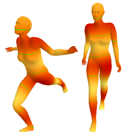
Fig. 3 EF 17 in different positions

Recent work applies the “ShapeDNA” method to medical data [10, 11]. Shape analysis is important for medical image analysis to assess morphological changes that go beyond volume differences. Since changes of interest for medical applications (e.g., for the assessment of brain changes in schizophrenia research) are frequently subtle, but may be investigated through population studies, robust shape descriptors such as the ShapeDNA need to be combined with procedures for statistical hypothesis testing. We have shown statistically significant differences in shape (using such a methodology) between the caudate nuclei (a subcortical gray matter structure of the human brain involved in memory function, emotion processing, and learning) of patients diagnosed with schizotypal personality disorder and the caudate nuclei of a normal control population. In particular, the study showed that in addition to significant variations in volume and surface area (already known before) real shape differences exist. In [11] the method has been extended to work directly on the voxel data obtained from MRI after segmentation. Different boundary conditions were analyzed (Neumann and Dirichlet) showing that the Neumann spectrum picks up shape differences already on a very coarse grid, making it better suited for 3D solid matching.